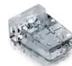
Half Dice Cube - 6 g 11 x 23 x 26 mm