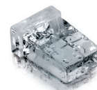
Half Dice Cube - 6 g 11 x 23 x 26 mm