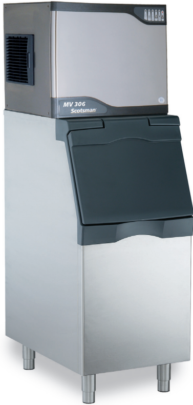
MV 306 with B322 (sold separately)