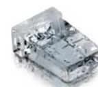
Half Dice Cube - 6 g 11 x 23 x 26 mm