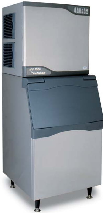
MV 1006 with B222-B322 (sold separately)