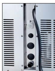
Recessed Connections Panel