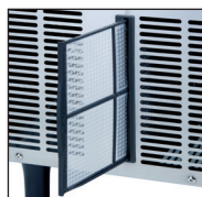
Proximity condenser air filter