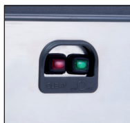
Front ON-OFF Switch